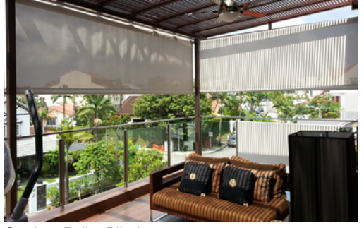
Outdoor Roller Blinds