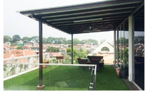
Aluminium Composite Panel with Metal Structure